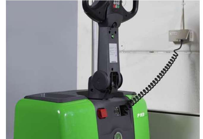
The control panel includes a pull-out power lead for the built-in battery charger.