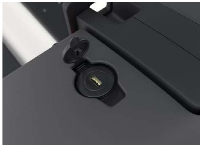
5V USB outlet for simple charging of smart phone, tablet or other external equipment.