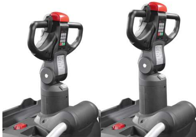
The height of the steering arm can be adjusted at the touch of a button.