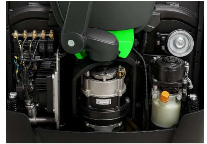
Easy access for efficient servicing.