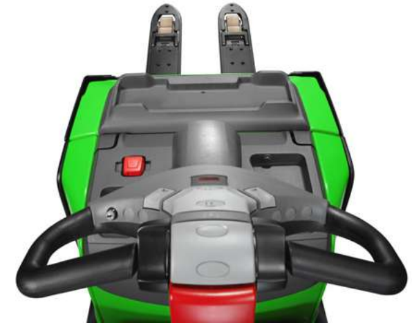
A clear view of the forks from the operating position.