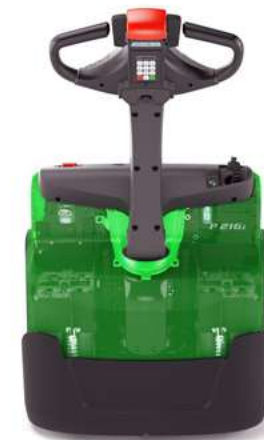
Unique Li-ion solution rethinking design standards and optimising component position.