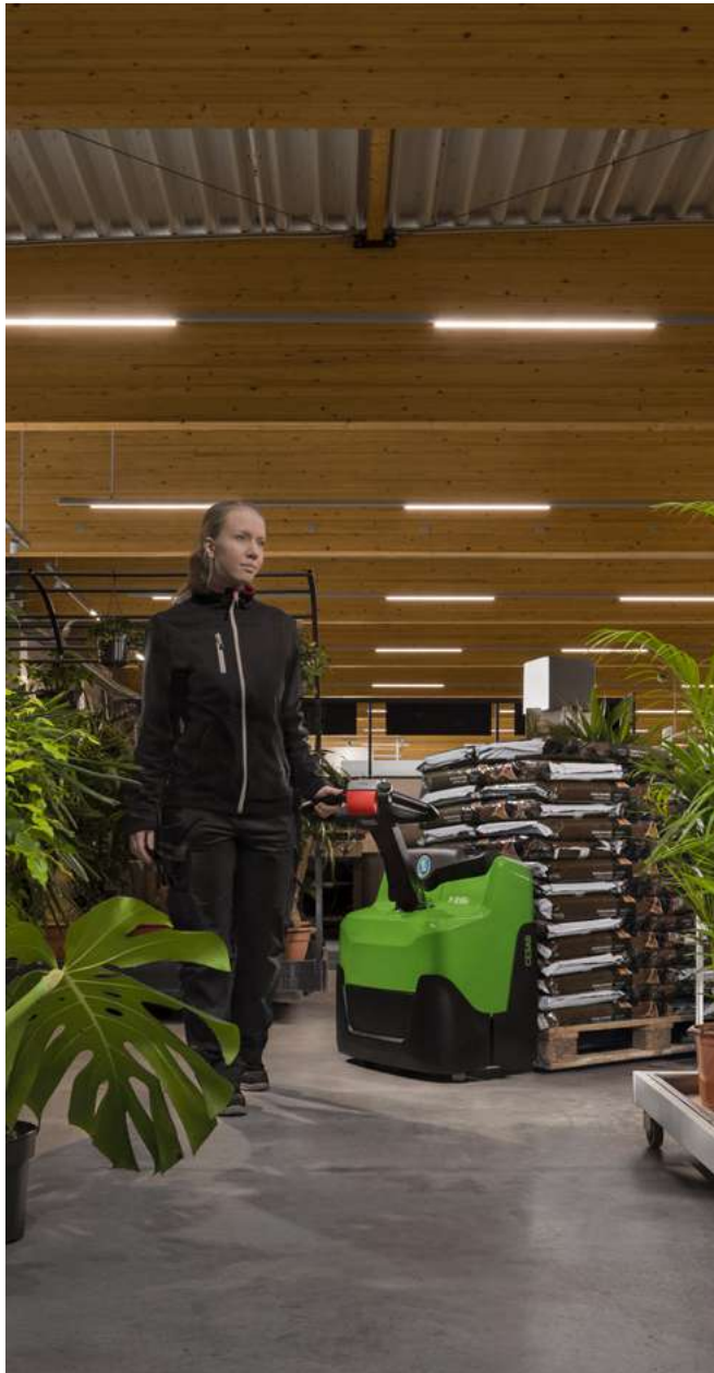
One compact machine offering easy manoeuvring in confined areas.