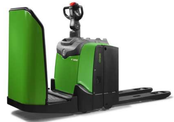
Fixed platform and backrest.