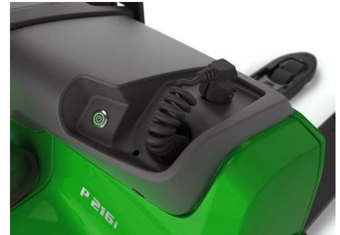
Easy and fast charging with the built-in charger for more energy efficiency (external charger also available).