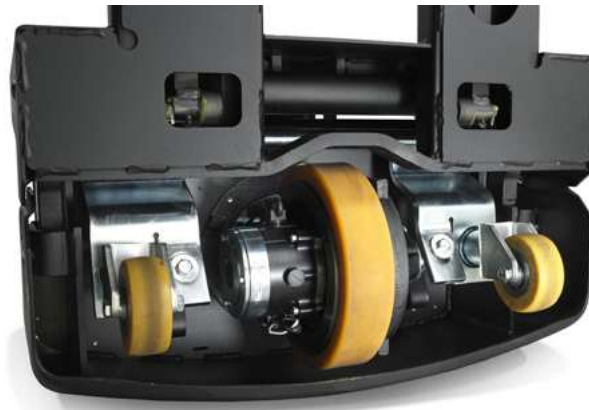
The unique Castorlink system protects castor wheels on uneven surfaces.