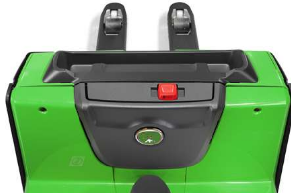
A clear and safe view of the forks.