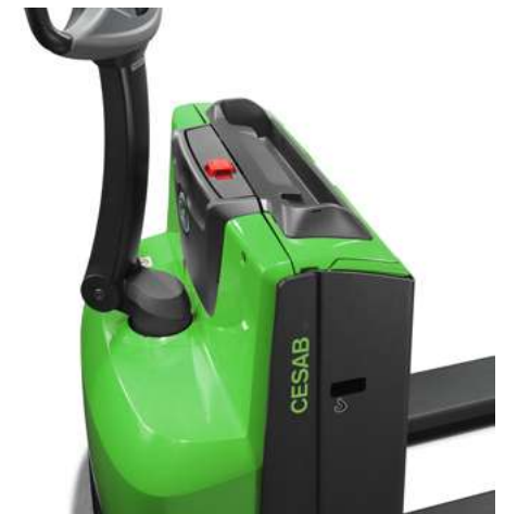
Robustness of the battery lid cover.