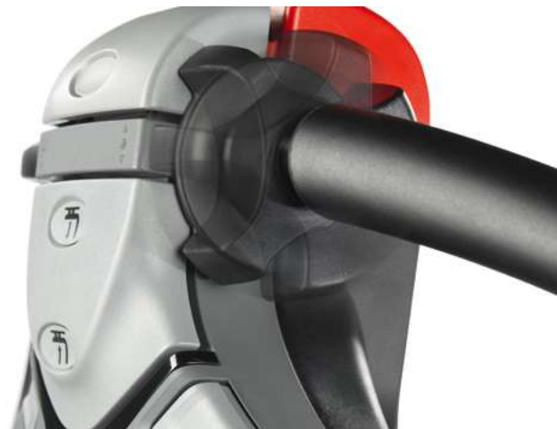
Fingertip control for drive, lift and lower with unique click-2-creep feature.