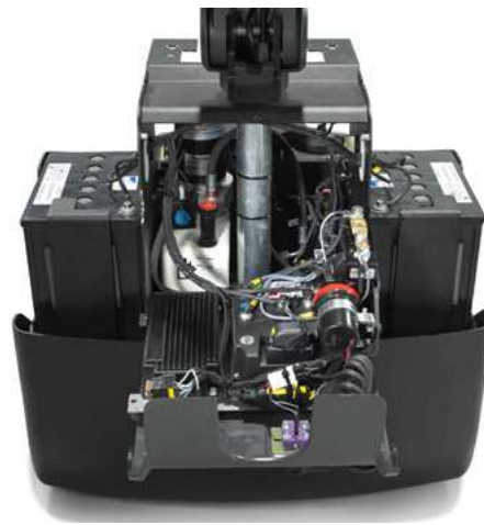
Easy access for efficient servicing.