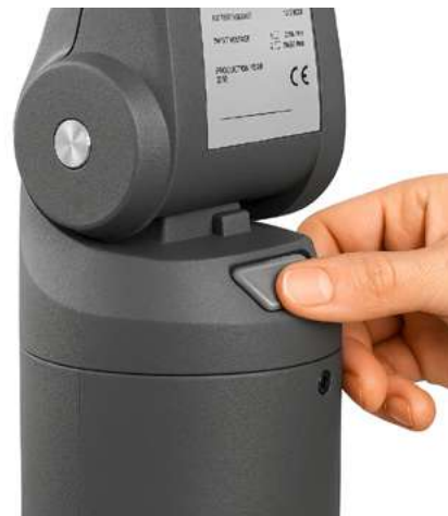
One-touch action to adjust the height of the tiller arm.